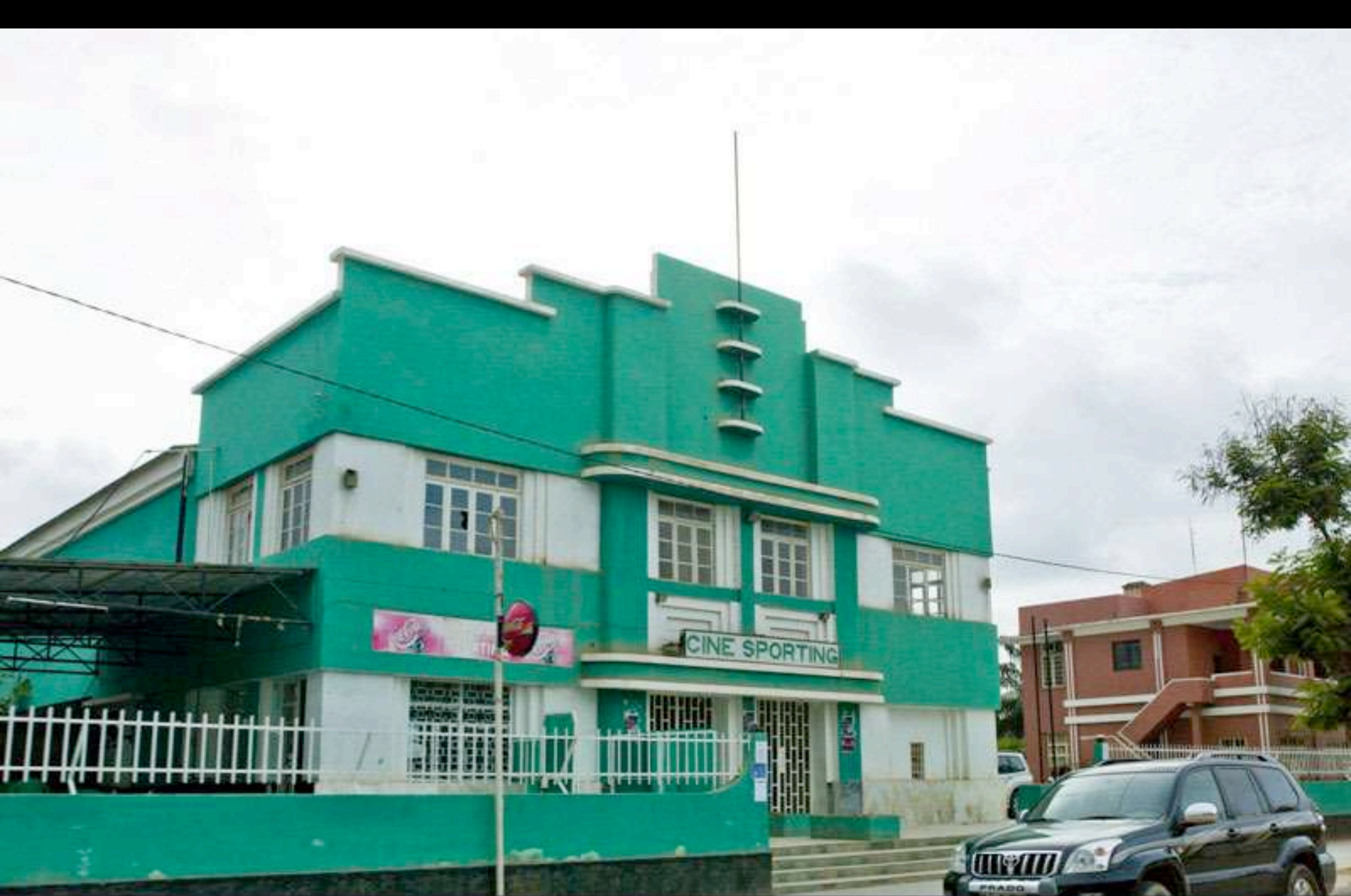
10 Cine Sporting, Sumba