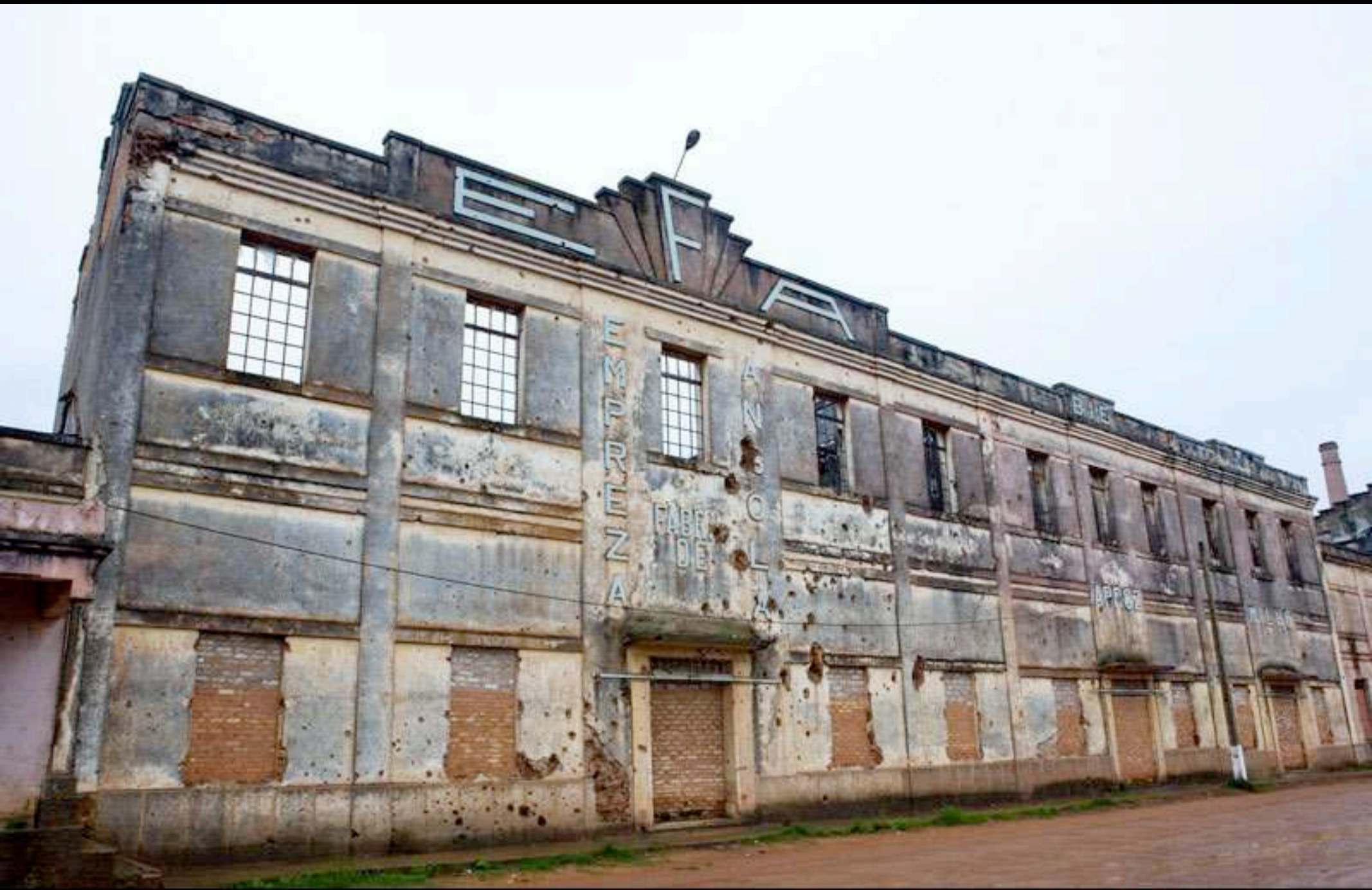
30 Empresa Fabrica , old Portuguese Factory, Kuito