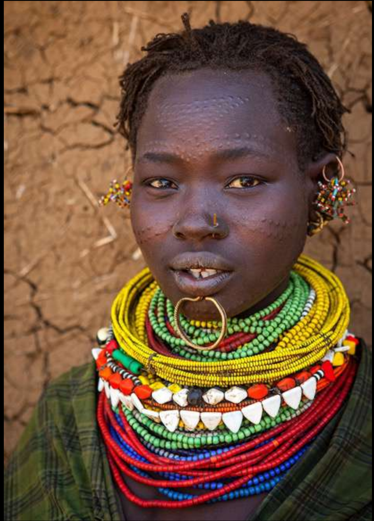
Once married, Toposa women from South Sudan get these impressive geometric scarifications on their belly. They also have scarifications on their face.