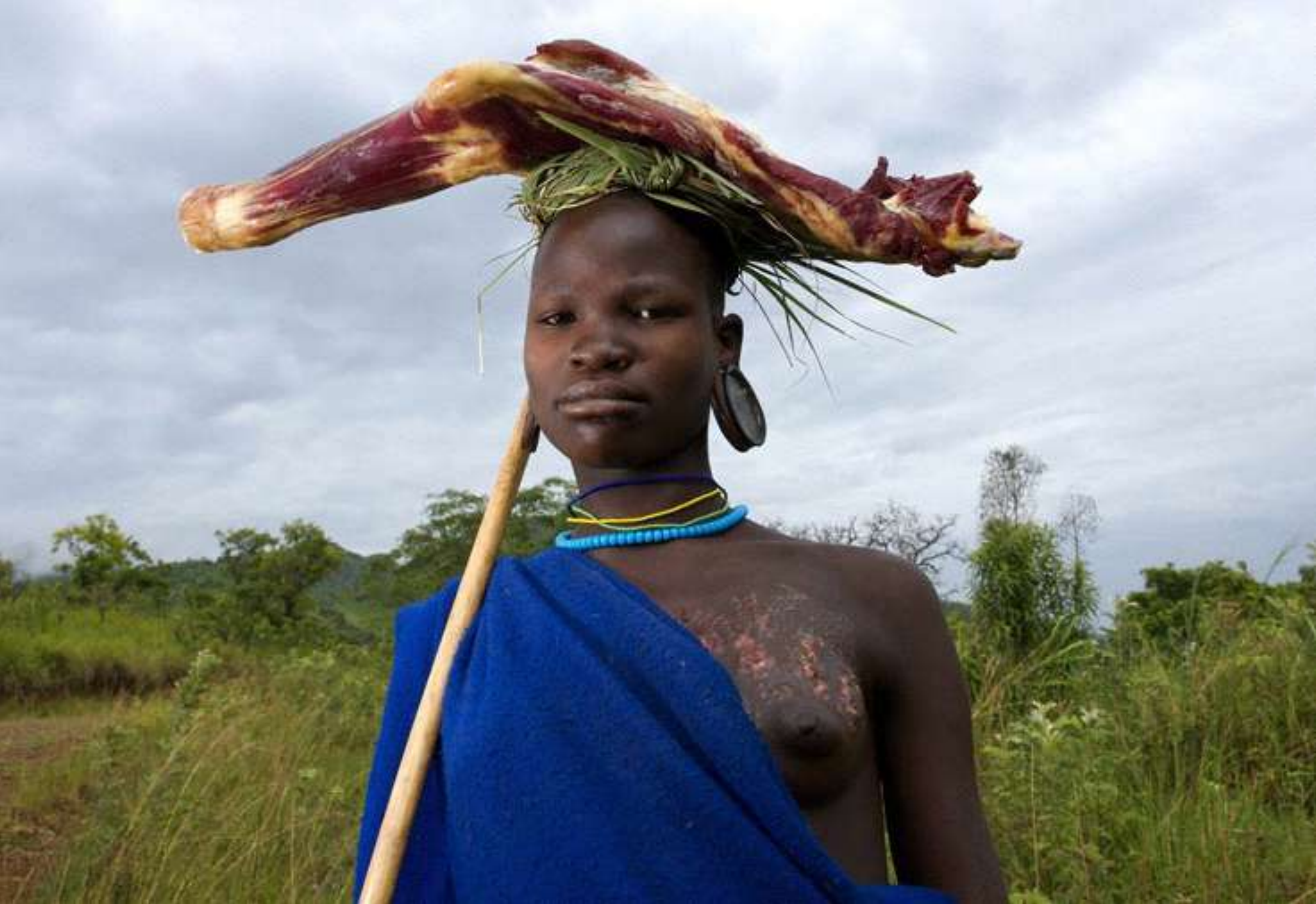
A Surma woman with fresh scarifications on her breast. Infections are common and sometimes turn scarifications into huge scars or even prove deadly for the weakest ones.