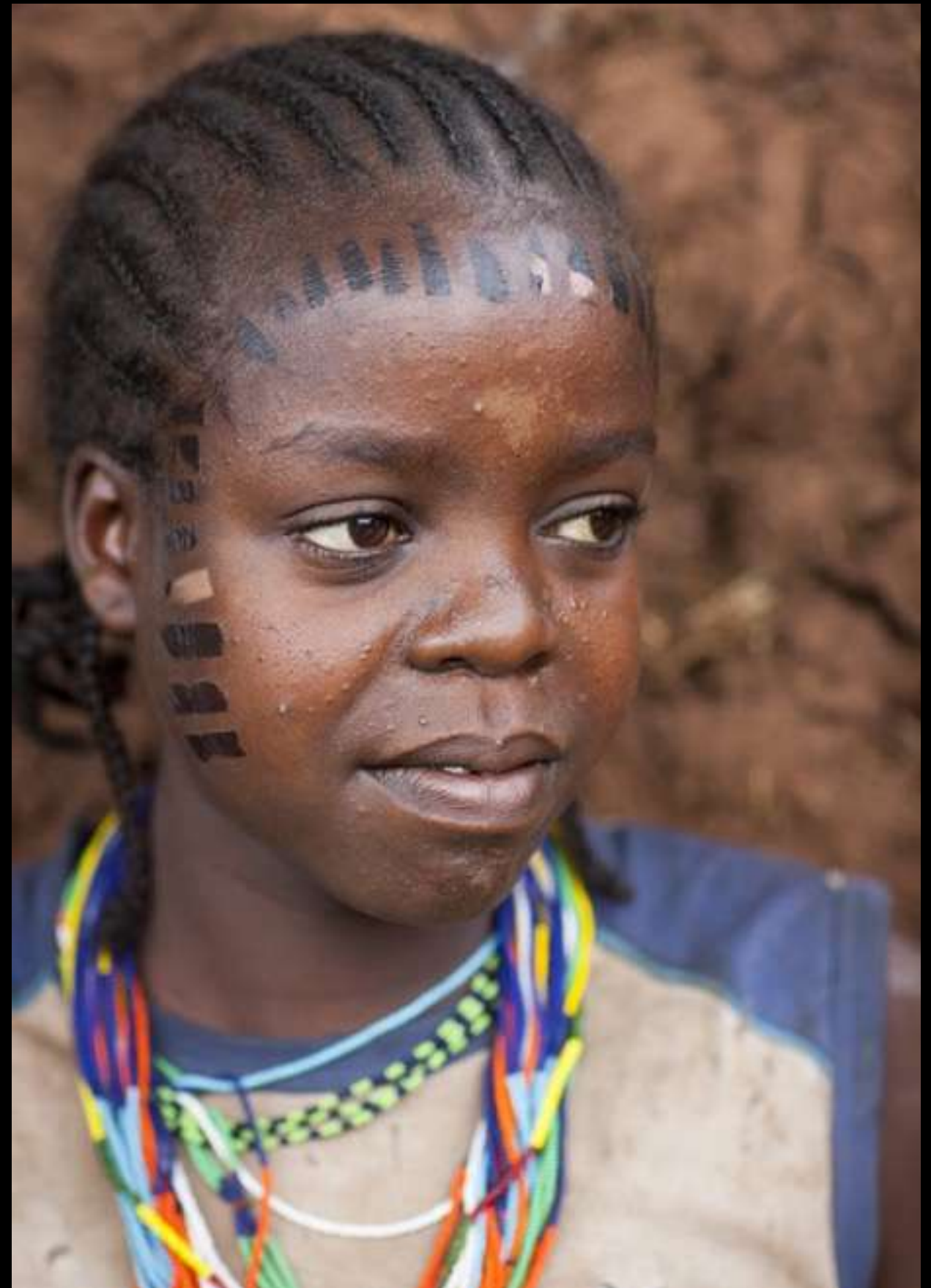
Women of the Menit tribe. They do not use blades to create the scarifications but instead scratch their skin with stones in order to decorate it.