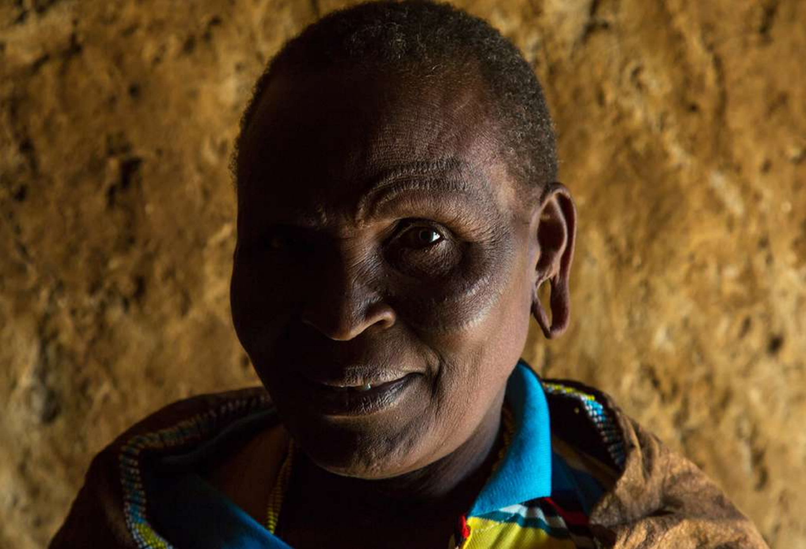
In Tanzania, on the Serengeti Plateau, women of the Datoga tribe bear strange scarifications around their eyes, which are believed to make them more beautiful.