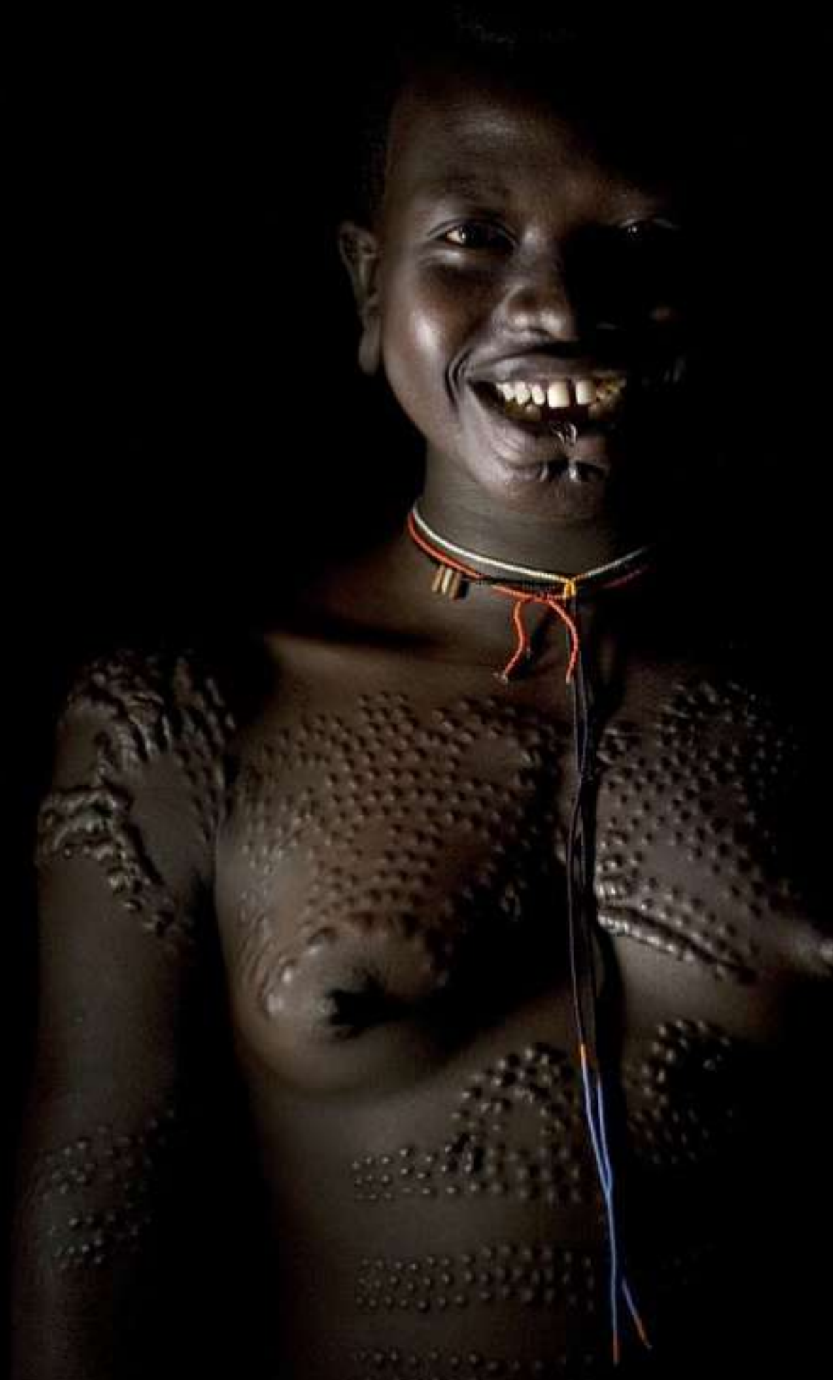
A woman of the Surma with a scarification covered chest. She is considered a beauty by the men in her tribe.