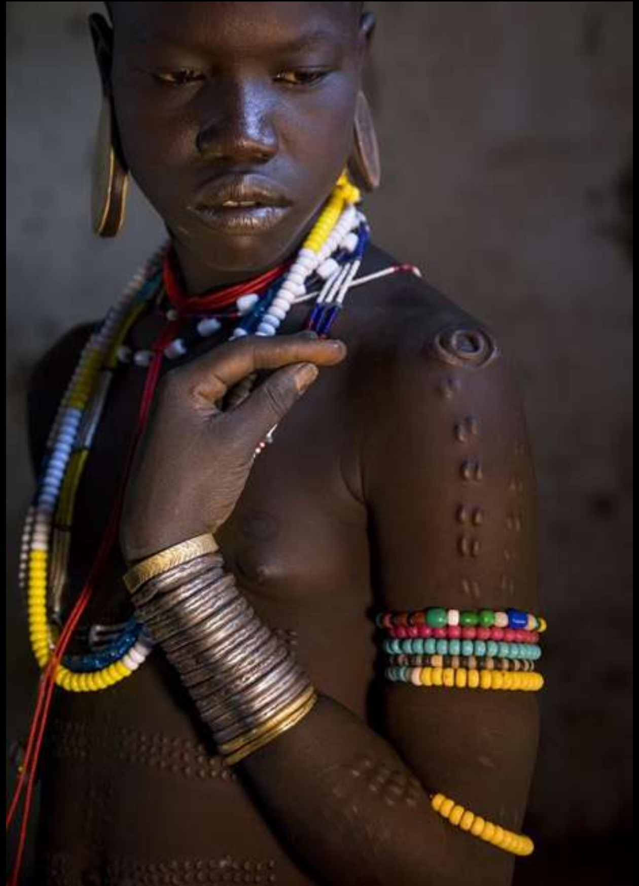
Women of the Mursi tribe. In Ethiopia, scarification served as a symbol of strength, fortitude and courage in both men and women. Scars were used to heighten beauty and admiration.