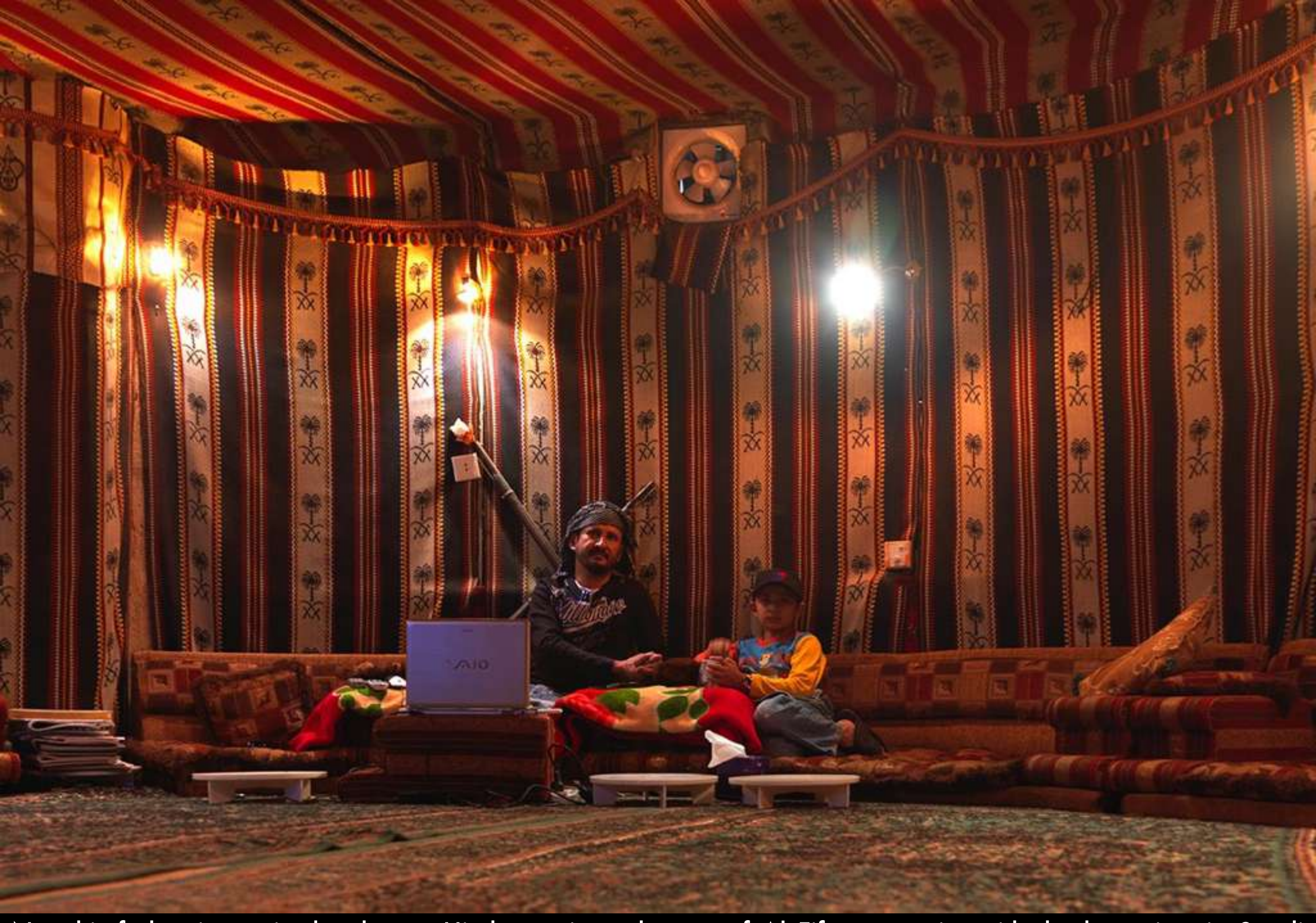
No, this father is not in the desert. His house is at the top of Al Fifa mountain, with the best view in Saudi Arabia. But the real fun for him is to be in a room where he has set up... a Bedouin tent.