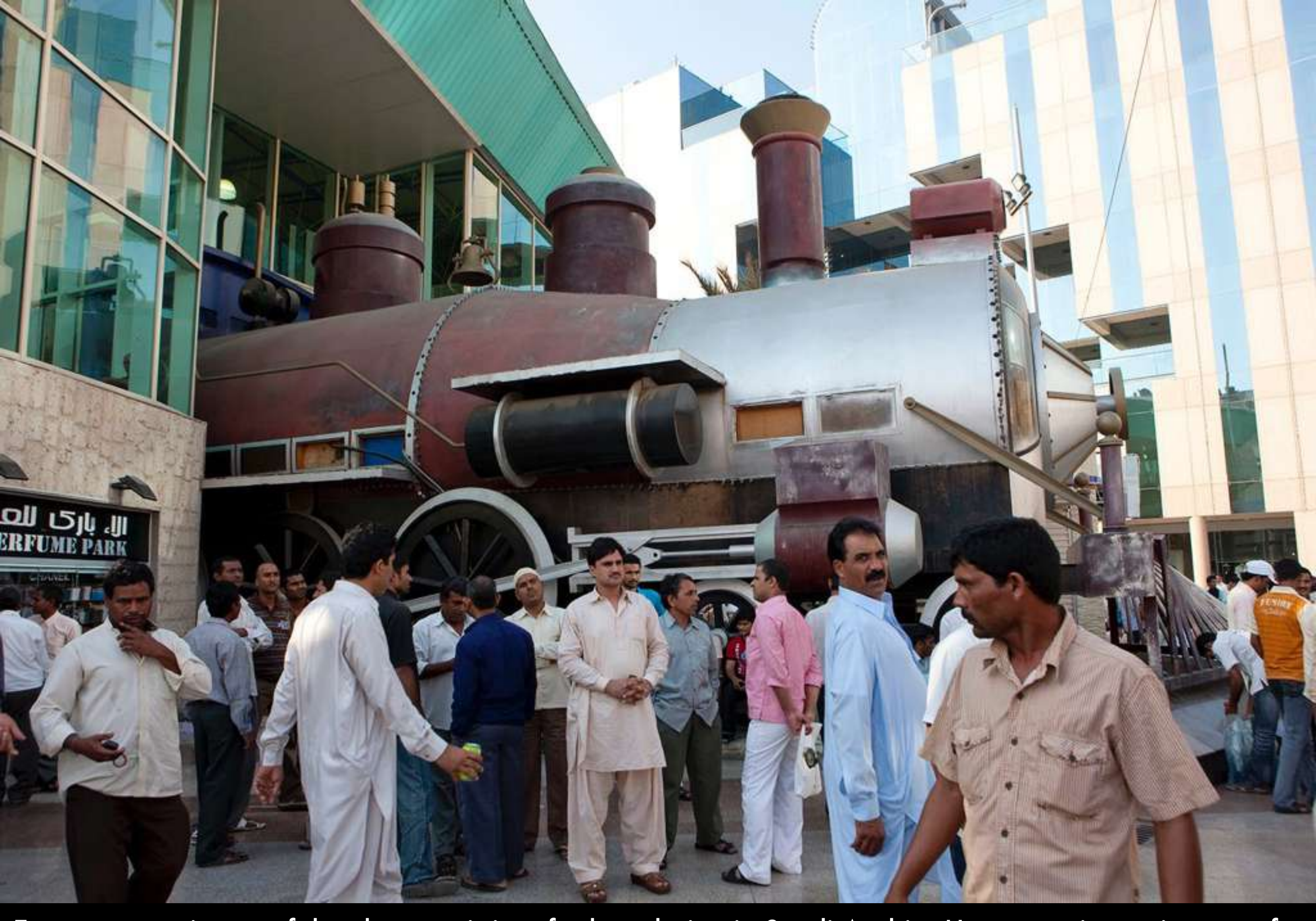
Extravagance is one of the characteristics of urban design in Saudi Arabia. Here, a train coming out of a store in Jeddah, in the main shopping street.