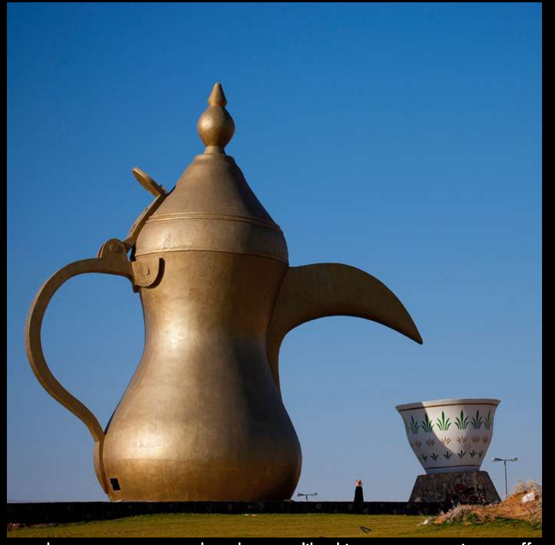
Roundabouts are each more extravagant than the next, like this one representing a coffee pot almost 20-meter high..