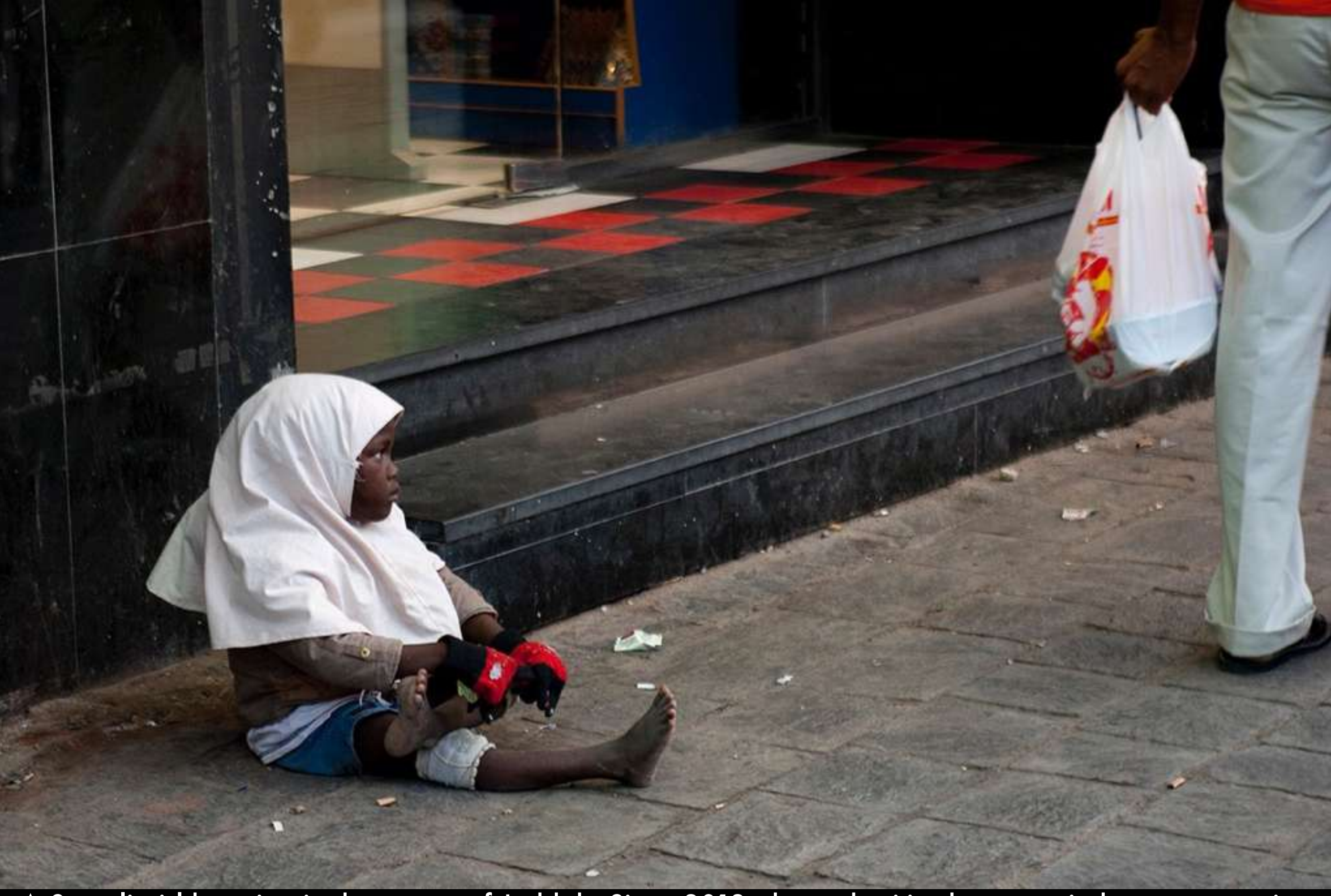
A Somali girl begging in the streets of Jeddah. Since 2013, the authorities have carried out a campaign to send back hundreds of thousands of illegal migrant workers, resulting in abuses against many of them and their forced return in a country at war.