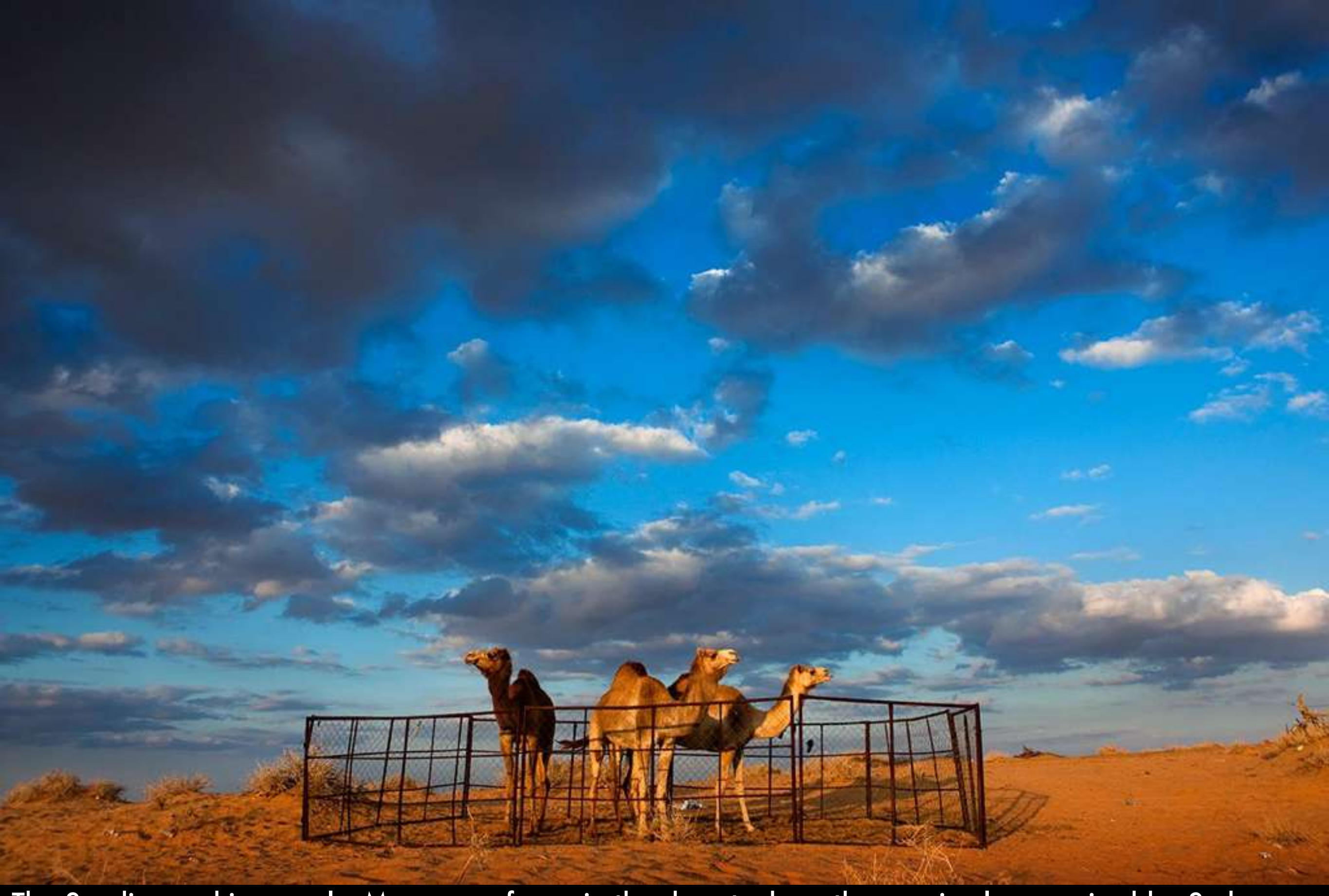
The Saudis worship camels. Many own farms in the desert where these animals are raised by Sudanese Rashaida. The most beautiful camels also generate substantial income thanks to the breeding services of the reproductive males.