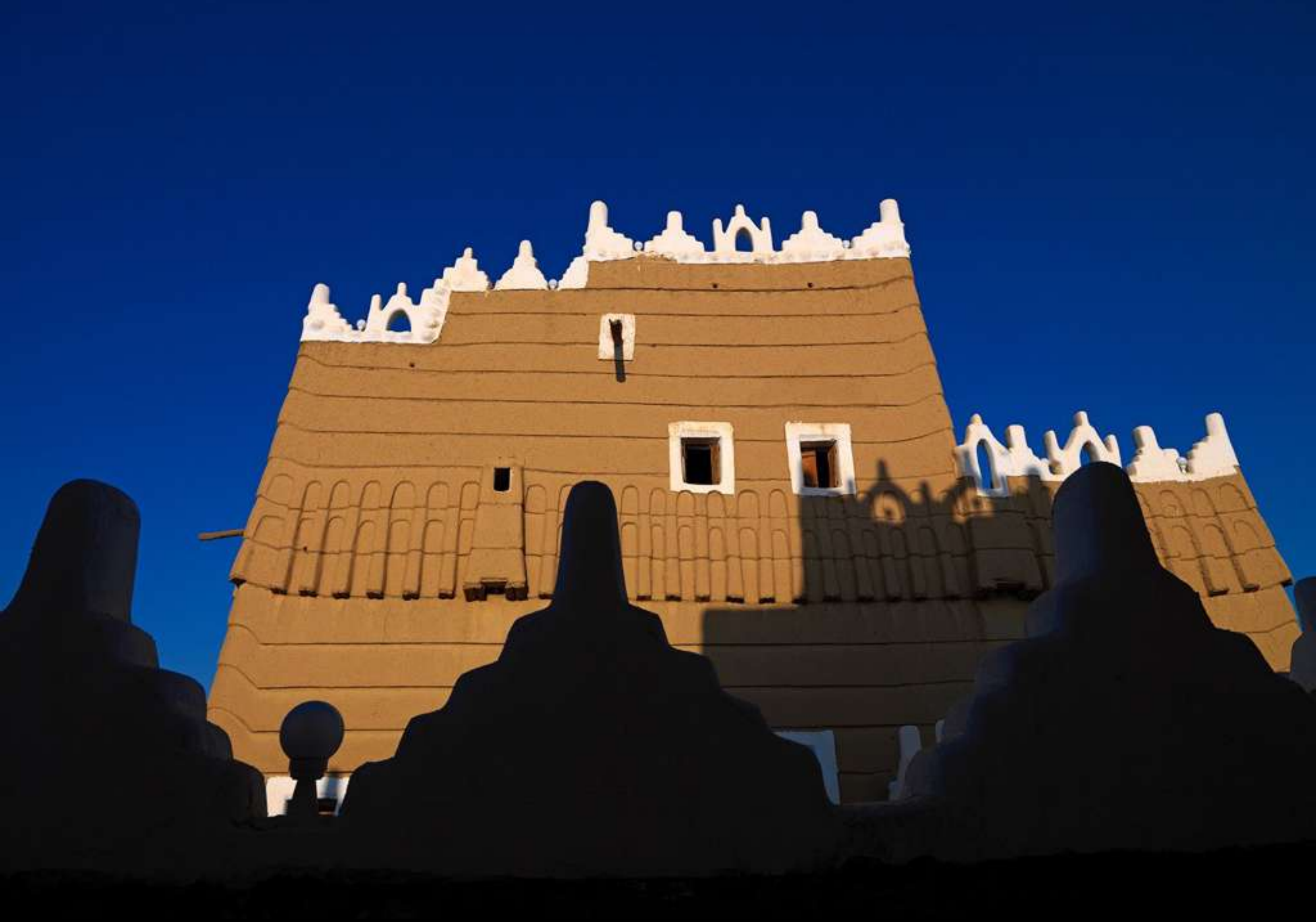
Heritage conservation is a priority of the Saudi government. The forts were all renovated to perfection.