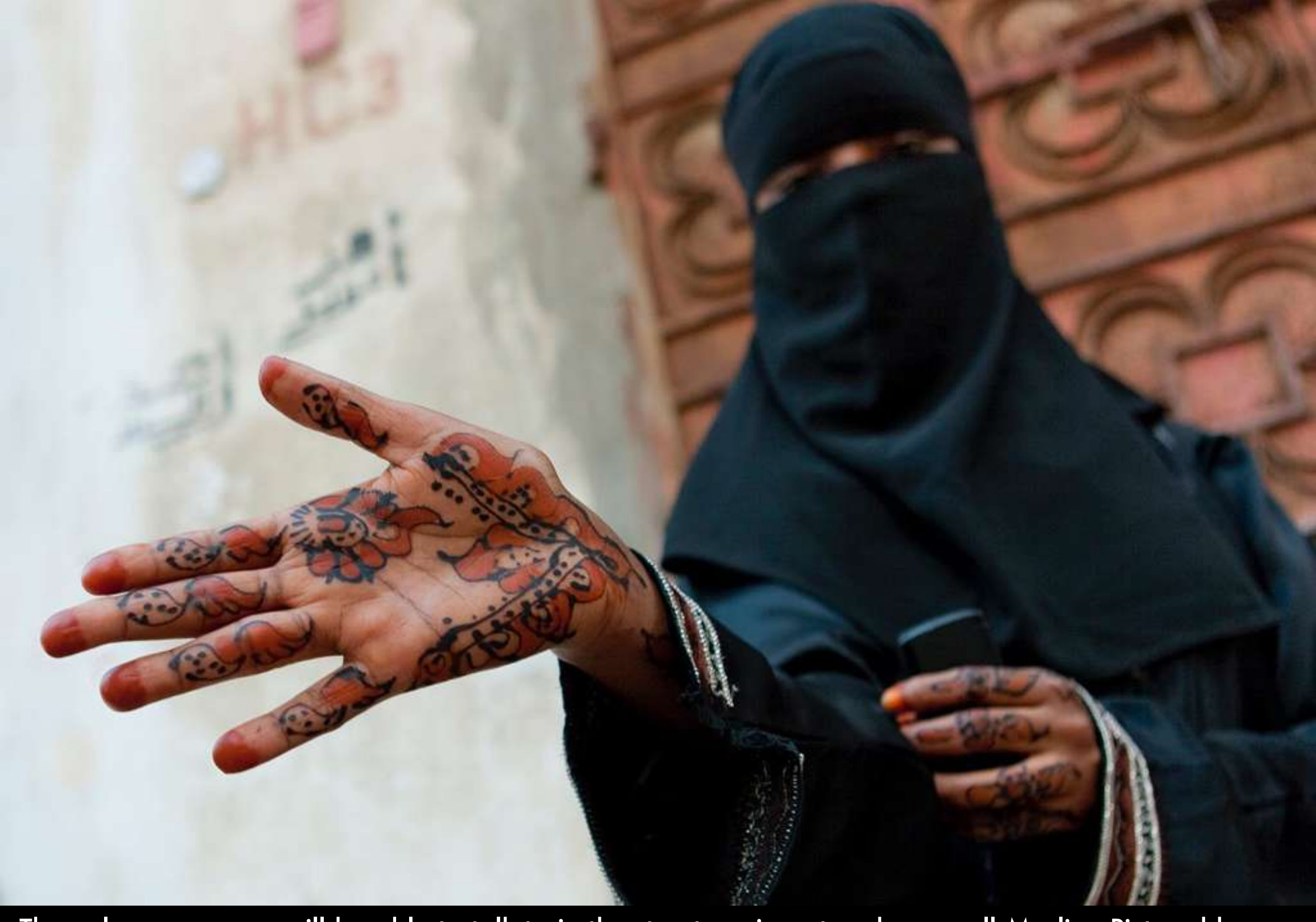
The only women you will be able to talk to in the street: emigrants, who are all Muslim. Pictured here a Somali girl in the streets of old Jeddah.