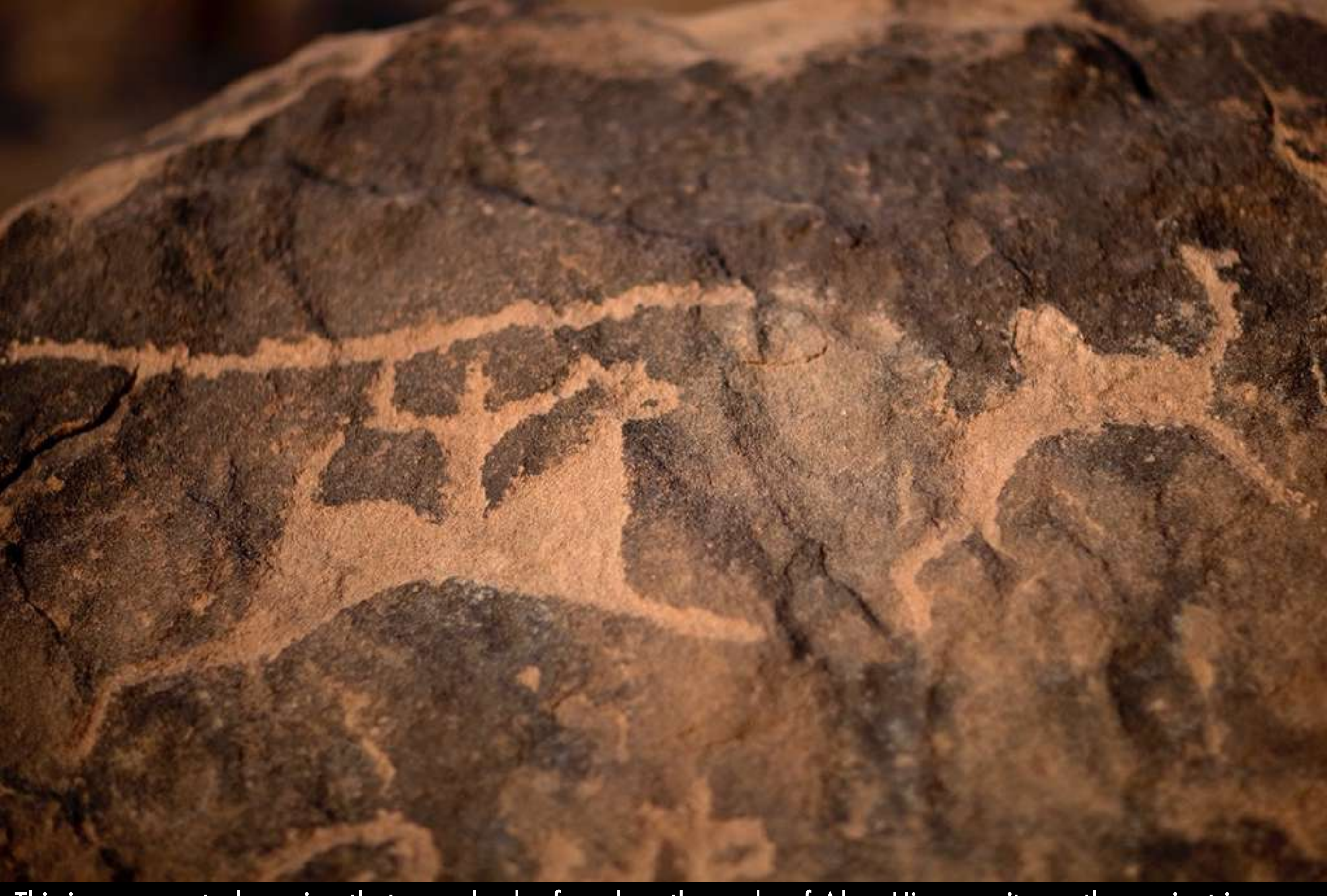
This is an ancestral passion that can also be found on the rocks of Abar Hima, a site on the ancient incense road... A hunter chasing a camel with a spear. Saudi Arabia is full of prehistoric petroglyphs on sites that are unprotected and accessible freely.