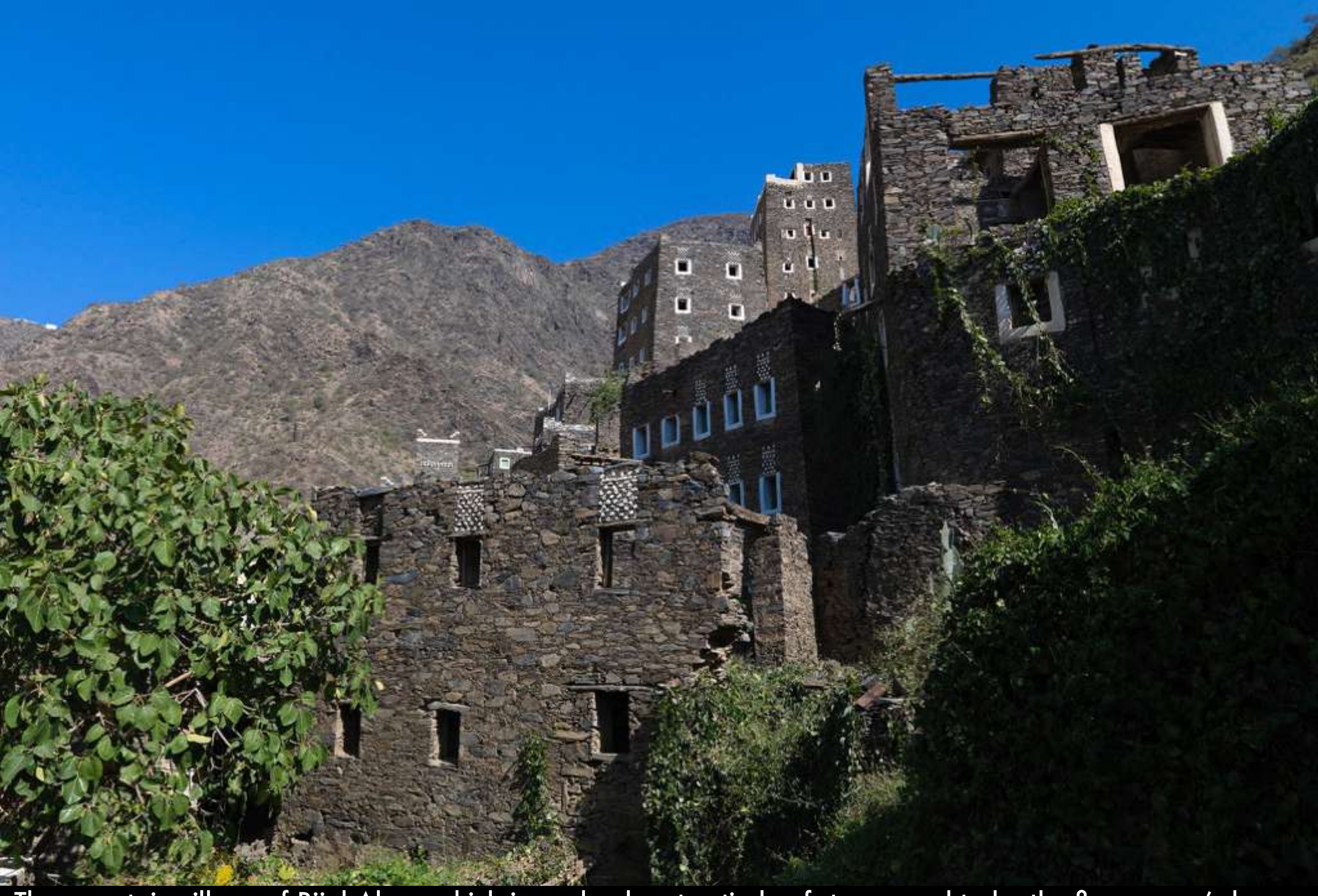
The mountain village of Rijal Alma, which is made almost entirely of stone, used to be the flower men's home. But most of them have left their old houses for easier access to water and the whole village has been turned into a tourist attraction.