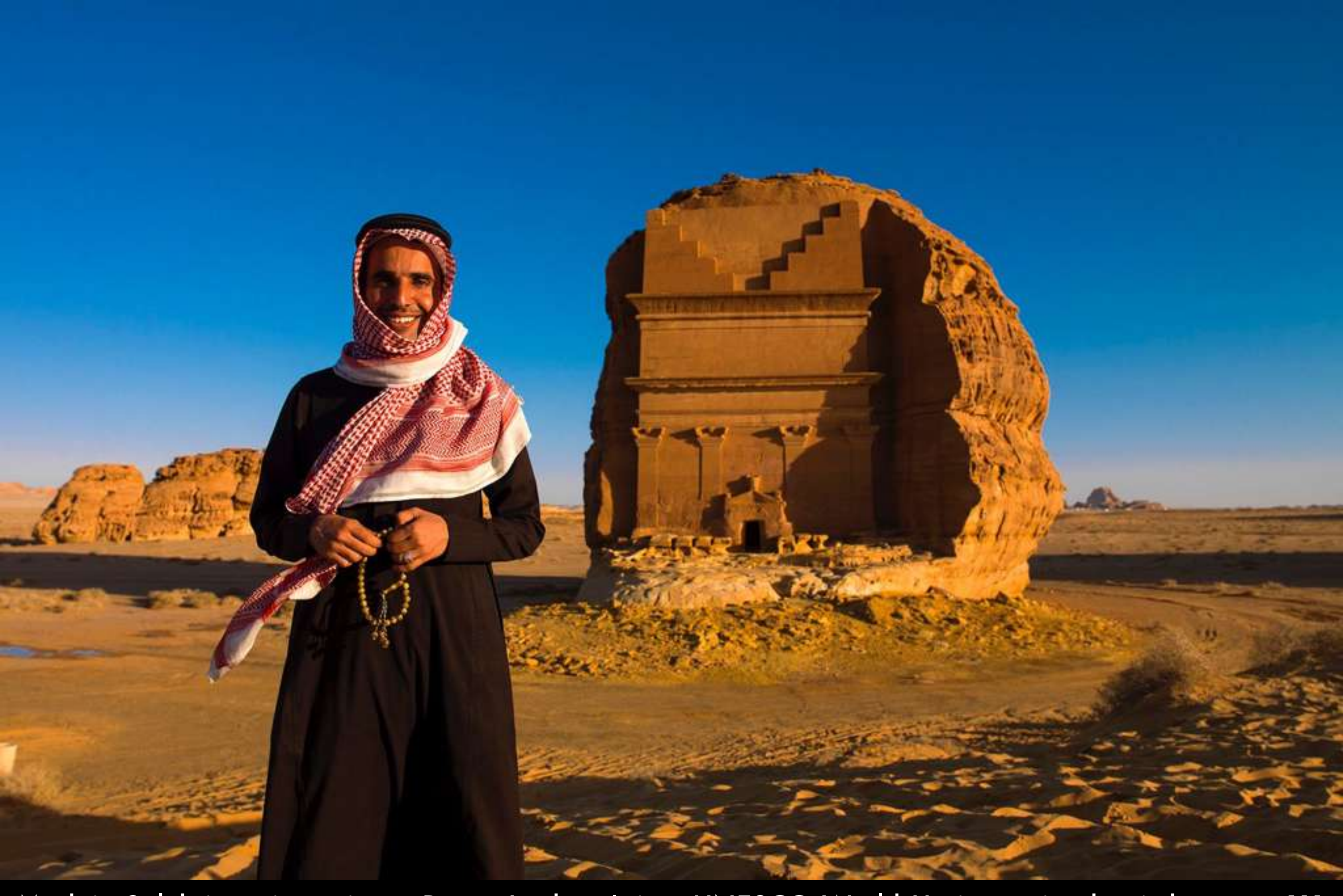
Madain Saleh is a sister city to Petra, Jordan. It is a UNESCO World Heritage site that is home to 111 perfectly preserved Nabatean tombs. The magic of the site also lies in the total absence of tourists, Coca-Cola sellers or souvenirs shops.