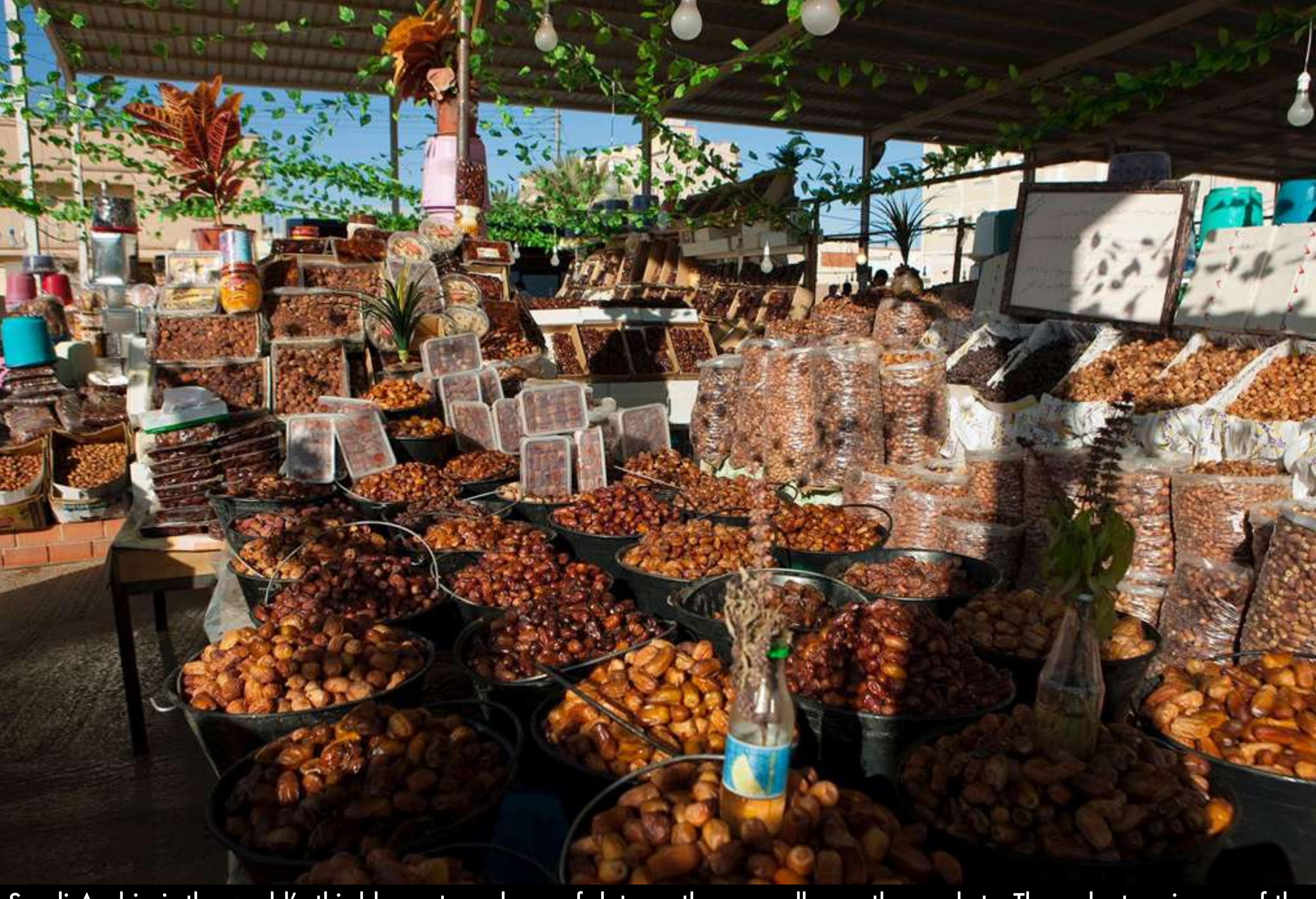
Saudi Arabia is the world's third largest producer of dates – they are all over the markets. The palm tree is one of the main symbols of the country. The stalls were deserted at the time of one of the five daily prayers because, a few minutes before, the muttawa, the religious police, came to remind the vendors of their duties and punish the ones who cheat.