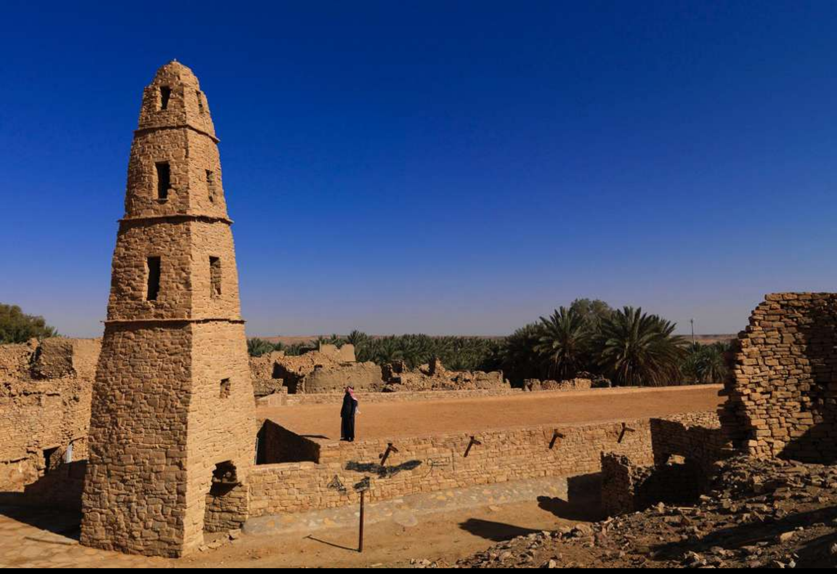
The Omar Ibn al-Khattab mosque was built with stones in 633 and is located in the town of Dawmat al-Jandal, an important crossroads of ancient trade routes connecting Mesopotamia with the Arabian Peninsula.