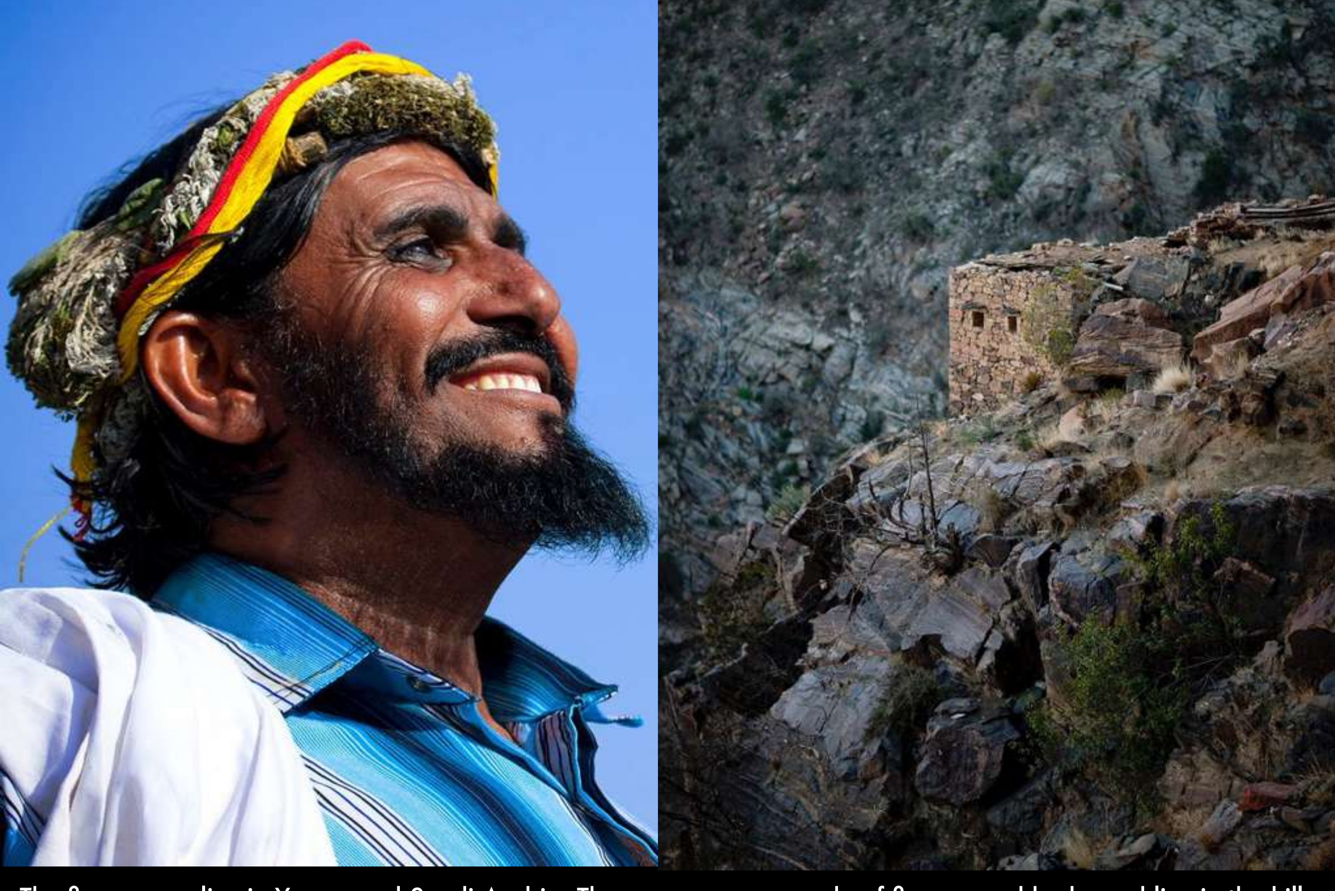
The flower men live in Yemen and Saudi Arabia. They wear crowns made of flowers and herbs and live in the hills. Meeting them at the souk of Al Farsha was really special. Hospitality is a concept that is foreign to flower men. Some of them seem to have stepped out of ancient frescos. Our mandatory police escort couldn't wait to leave.